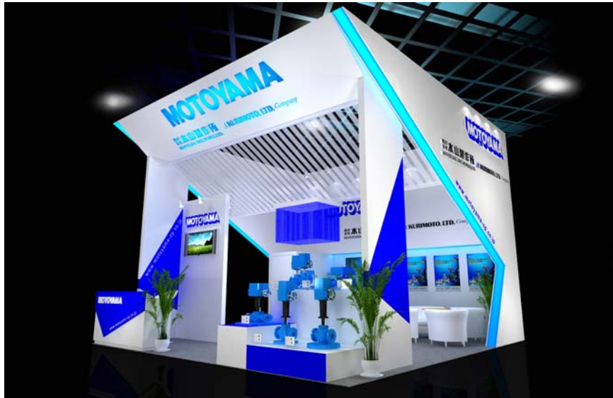
Our booth (Mockup image)